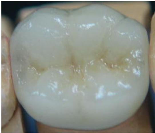
.....○ MEDIUM ○.....