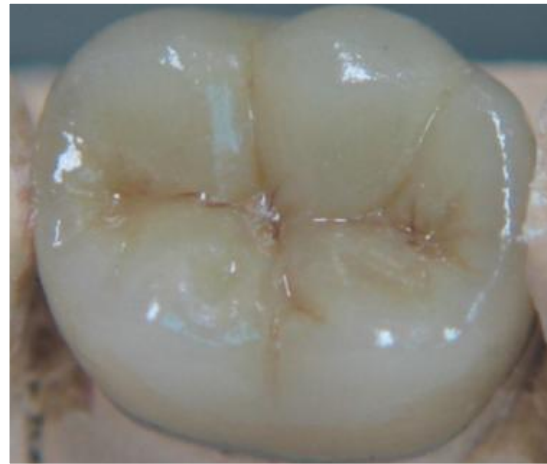
.....○ DARK ○.....